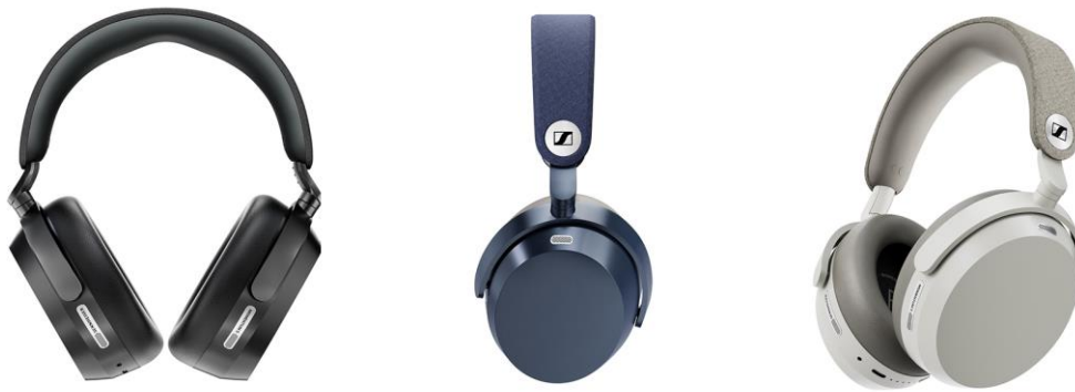
MOMENTUM 5 Wireless in black, denim, and white colorways

3.5mm analog audio cable for connection to in-flight entertainment systems, laptops, and more.