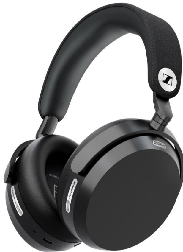
MOMENTUM 5 Wireless features spatial audio with head-tracking and a user-replaceable battery

possibilities even further with Hi-Res Audio certification, and Snapdragon Sound™ technology featuring Bluetooth® audio codec support up to aptX™ Lossless. Using the free Smart Control Plus companion app's new 8-band EQ, bespoke presets, and intelligent Sound Personalization engine, the iconic house sound can be shaped to practically any preference with ease.